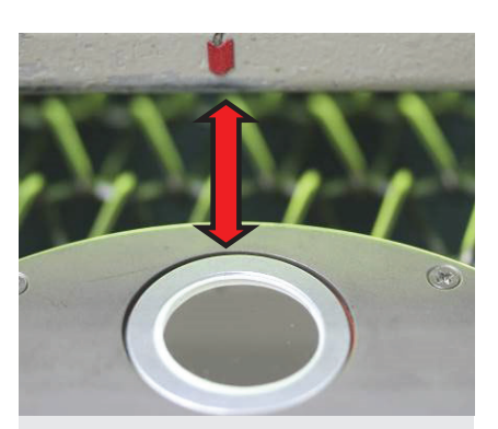
Figure 1. Index marks to align optics.

Consistency in measurement means allowing your UV system to warm up and stabilize per the recommendations